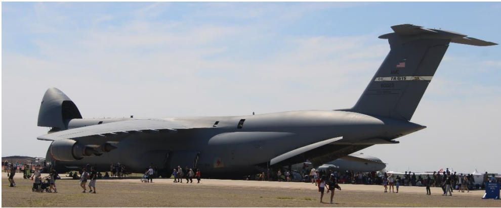
C-5 at Luke Days 2024