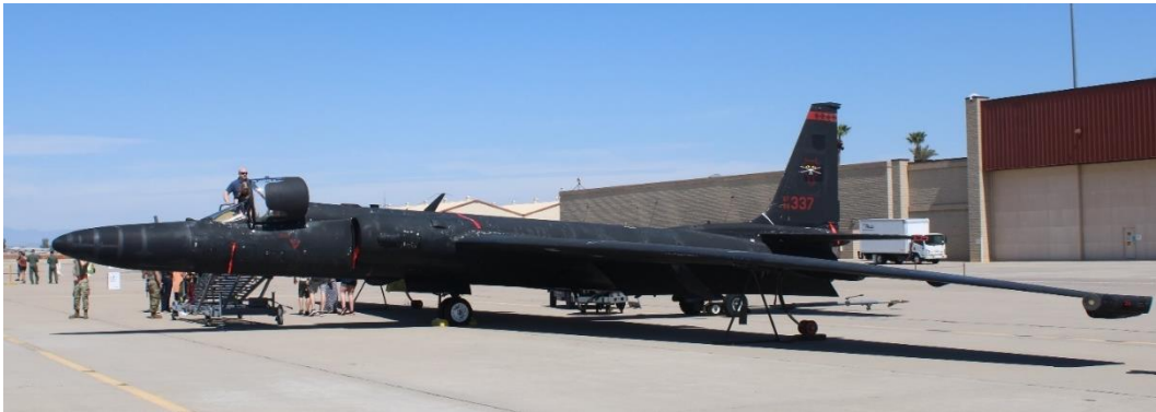
U-2 at Luke Days 2024