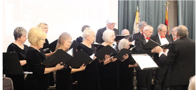
The West Valley Singers at our April Dinner