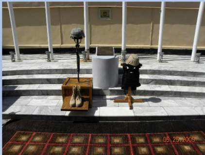
Memorial Service Camp Eggers, Kabul