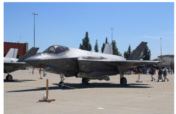
F-35 at Luke Days 2024