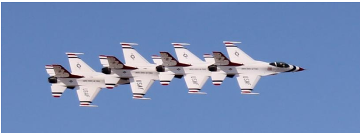
Thunderbirds Luke Days 2024

ARIZONA LTC CERTIFICATION LICENSE 5756150