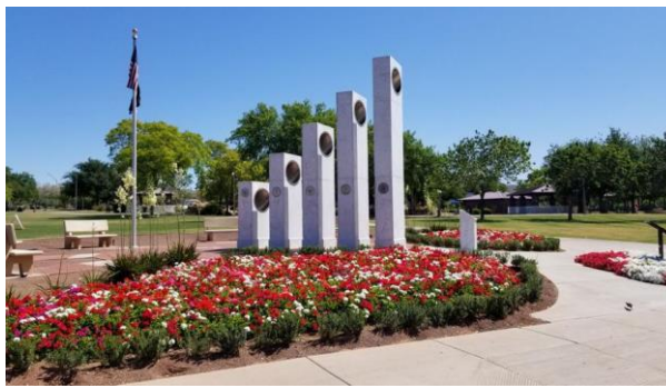
Anthem Veterans Memorial