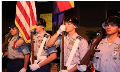
Dysart HS Army JROTC Cadets present colors at membership meeting

We also have fun, build camaraderie, and support each other.