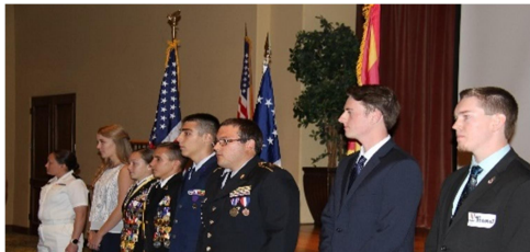
Scholarship winners being recognized at membership dinner.