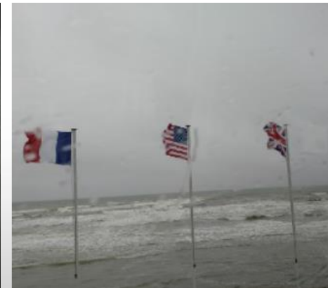
We remember Omaha Beach, Normandy