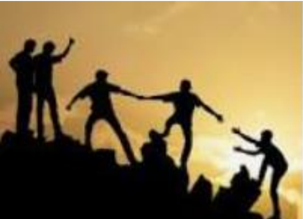
*Benefits of teamwork March 17, 2021